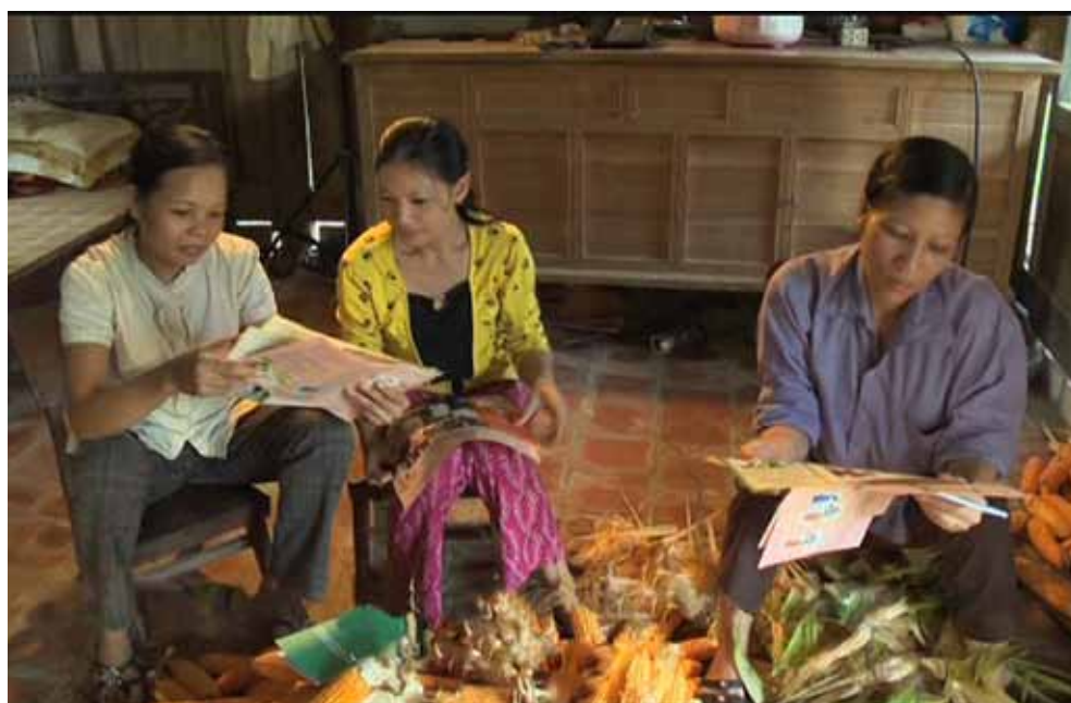
DV information provided to the community

Policymakers need successful and evidence-based models of programming in order to make adequate policy, strategy, programme and budgetary decisions with regard to the development and provision of services for survivors of GBV/DV. These lessons learned provide a strategic direction on GBV/DV response in Viet Nam, including information that will help them in developing an intervention model that suits the needs of the Vietnamese society, culture and political and administrative structures.