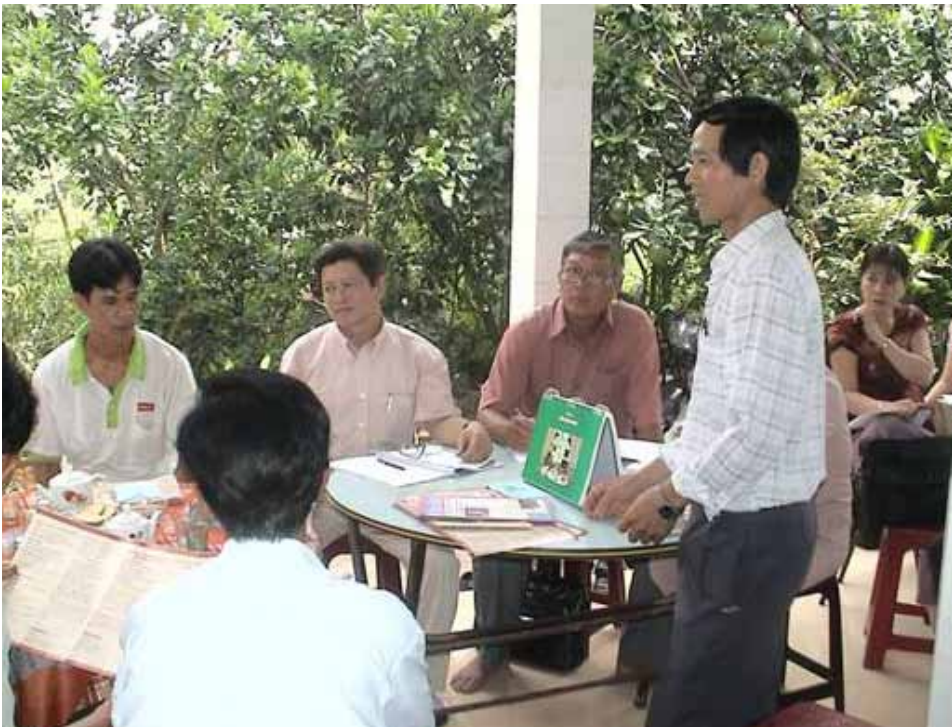
Discussion on DVPC at a residential meeting in Binh Dai district, Ben Tre province